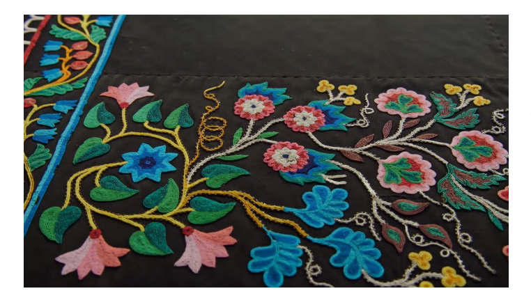
The Flower Beadwork People Parks Canada (click on the Image)

MYBC YOUTH:. The Forgotten Ones-Voices of the Métis in BC.